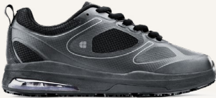
Revolution II Black: 29167